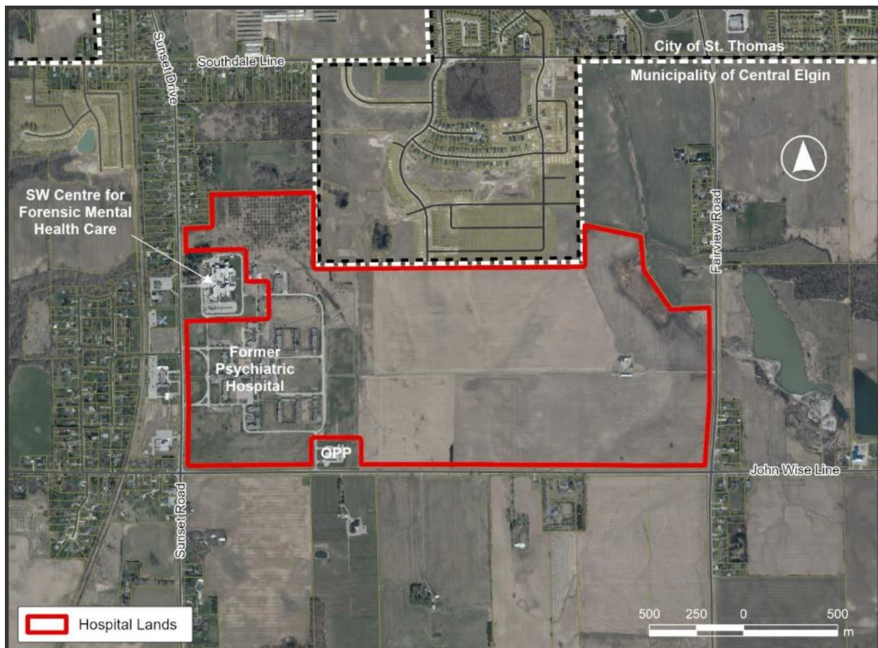
Map 1. Location of the Hospital Lands Area

The Hospital Lands area is identified on Map 1 . The site includes the vacant hospital buildings, the active Southwest Centre for Forensic Mental Health, an Ontario Provincial Police detachment, and agricultural lands with existing farm buildings. There are also existing soccer fields adjacent to the former hospital complex. The property totals approximately 168.5 ha (416 acres) with approximately 32 ha (79 acres) occupied by the former hospital buildings. The remainder of the site is agricultural, natural heritage, or otherwise undeveloped.